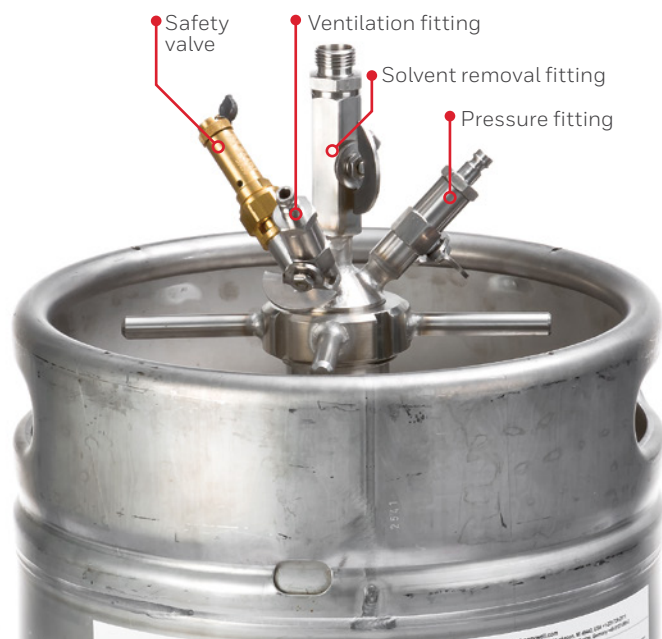
Dispensing head for containers with integrated dip tube